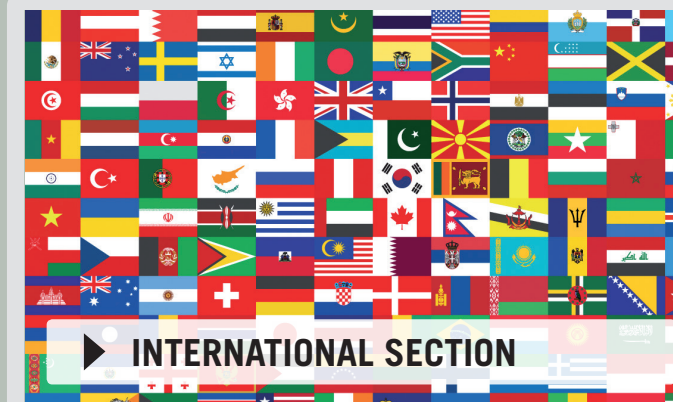
► INTERNATIONAL SECTION

While the mafias and corruption increasingly know no borders, the social anti-mafia cannot remain on the borders of a single country. Libera has thus decided to engage in the international dimension of its commitment, involving associations, names and numbers of different origins and with different geographical focus, particularly in Latin America, Europe and Africa