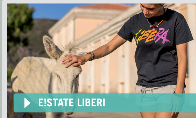
► ESTATE LIBERI

Every summer, thousands of young and less young people participate in engagement and training camps on confiscated assets from mafias. This is a week dedicated to training on social anti-mafia issues and knowledge on the areas involved, immersion in social commitment experiences and in-depth study.