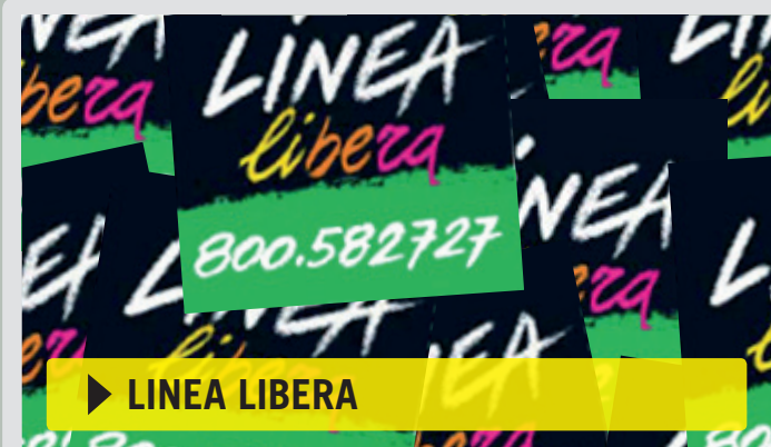
► LINEA LIBERA

Linea Libera is a listening and support service, totally free of charge, which aims to react to mafia violence. It accompanies the victims, organising with them the reporting process, overcoming loneliness. It is aimed at victims of organised crime, usury and extortion who need to be accompanied along the way of reporting and social redemption and is at the service of those who, as a public employee, want to report to the National Anti-Corruption Authority episodes of opacity and corruption within the Public Administration.