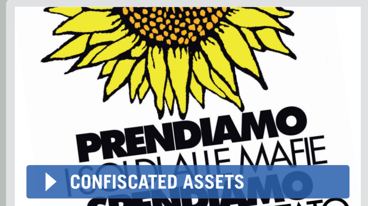
► CONFISCATED ASSETS

Libera does not directly manage the assets confiscated from organised crime but promotes training and participatory planning activities, so as to activate processes of local development and to increase social cohesion. Not only an economic path, but also social and cultural journey. Every confiscated asset returned to the community becomes a sign of hope and bears witness to the beauty of public ethics as well as a sign of the positive presence of the State and institutions in the territory.