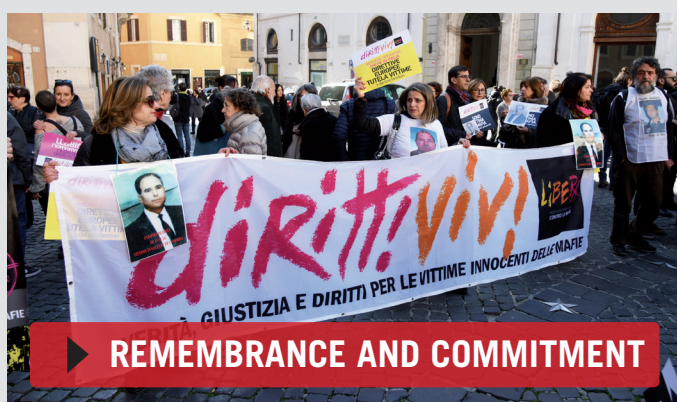
► REMEMBRANCE AND COMMITMENT

Libera Memoria deals with both keeping alive the memory of the mafias' innocent victims and walking alongside their relatives, organising debate and training opportunities. Thanks to their generous testimonies, it collects the stories of the mafia's innocent victims. Libera assumed the responsibility of knowing these stories, supporting family members in the process of transforming pain into commitment, demanding truth and justice for all the victims was to build together a public and shared memory ( vivi.libera.it ). We have practiced this every year, since 1996, with the Day of Remembrance and Commitment in memory of the Mafia's innocent victims.