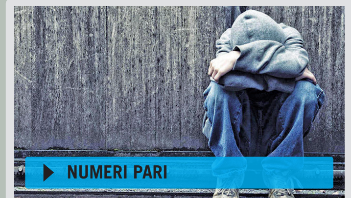
► NUMERI PARI

The Numeri Pari network virtually takes up the baton with the "misericordia ladra" campaign, with the aim of creating a movement that puts poverty and inequality back at the centre of the political agenda, for a fairer society based on social and environmental justice.