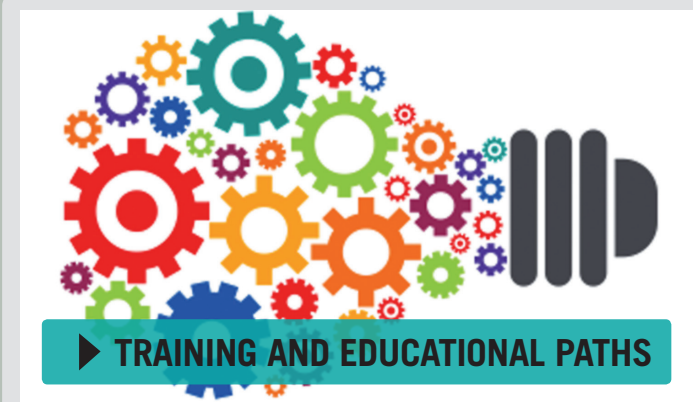
► TRAINING AND EDUCATIONAL PATHS

Libera has always been involved in schools, universities, and working with young people, alongside teachers, in parishes, with many voluntary associations. Training is fundamental to supporting our commitment and the construction of civil practices to counter social injustices, corruption and mafias, for the construction of cohesive contexts, attentive to civil and human growth of individuals in communities.